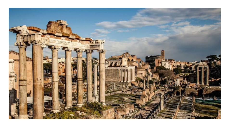
Crowne Plaza Rome – St. Peter's Via Aurelia Antica 415 Rome, 00165, Italy

18<sup>th</sup> June- 24<sup>th</sup> 2022